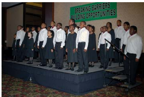
The Kansas City Boys and Girls choirs share their talents with MORE 2 Banquet attendees.

The Gilead Table is pursuing initiatives related to teacher development and adopt-a-school programs. The Table will create the 2009 legislative agenda for the Education Task Force, with consideration of the priorities of the school districts represented on the Table.